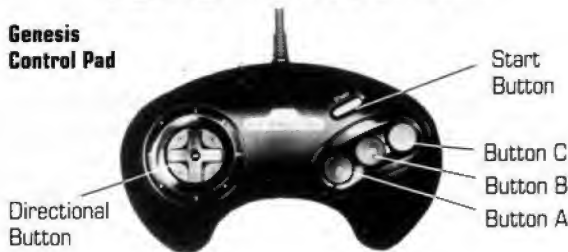
Genesis Control Pad